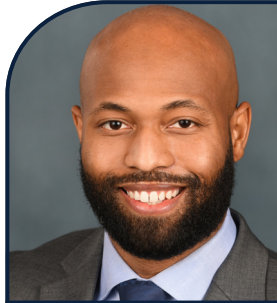
Kirkland Carden District 1